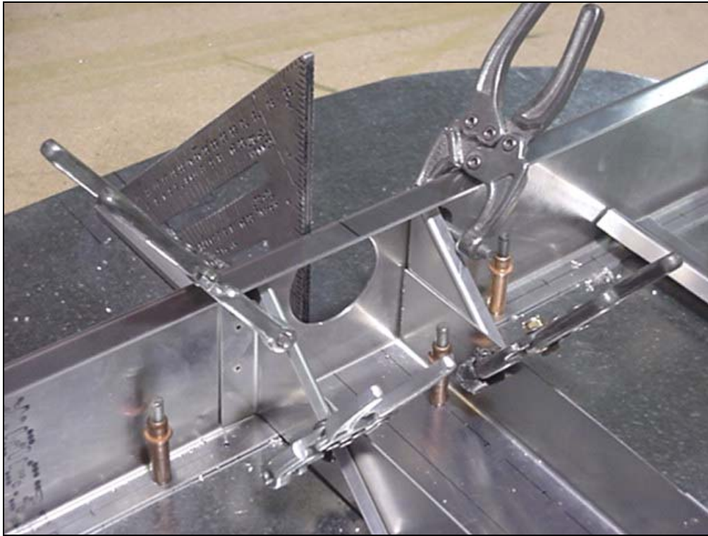
7F7-9C Gear Gusset 7F7-1SP Upper Channel

The Gear Gusset is positioned on the Vertical Lower Channel and Upper Channel. Using a square will keep the Upper Channel square with the Firewall. Once the Gusset is in position, clamp the Gusset in place.