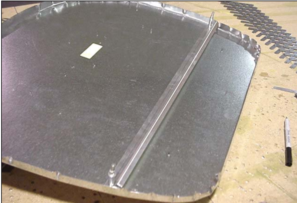
'Z' Angle 7F1-1 Firewall

Layout three rivet-lines. Plan for a no rivet zone area for the engine mount. Drill and cleco.