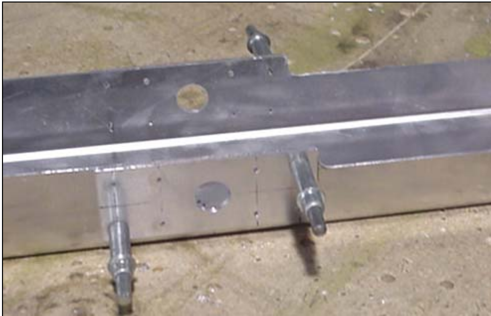
7F7-2C Vertical Lower Channel 7F7-8C Channel Doubler

Open up the center hole to 5/8" hole for the Bungee Pin.