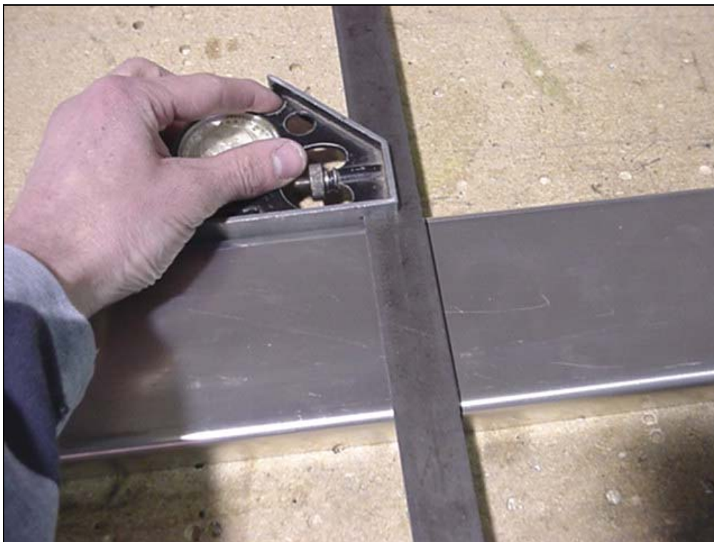
7F7-1SP Upper Channel

Locate and mark the centerline on the Upper Channel.