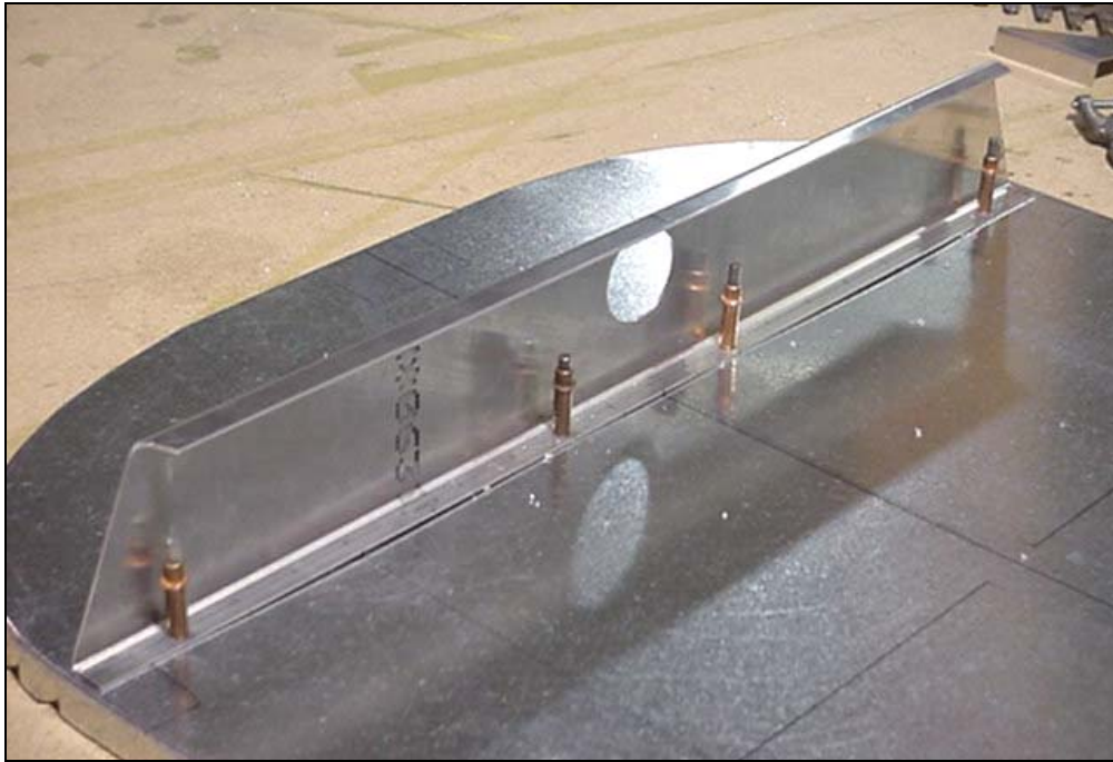
7F7-1SP Upper Channel 7F1-1 Firewall

Layout the rivet line on the Upper Channel. The rivet pitch is 35mm, but when laying the rivet pattern out, don't forget the no-rivet zone for engine mount and the location of the Vertical Lower Channel and Firewall Stiffeners. Drill and cleco just a few holes until all the parts are in position on the Firewall.