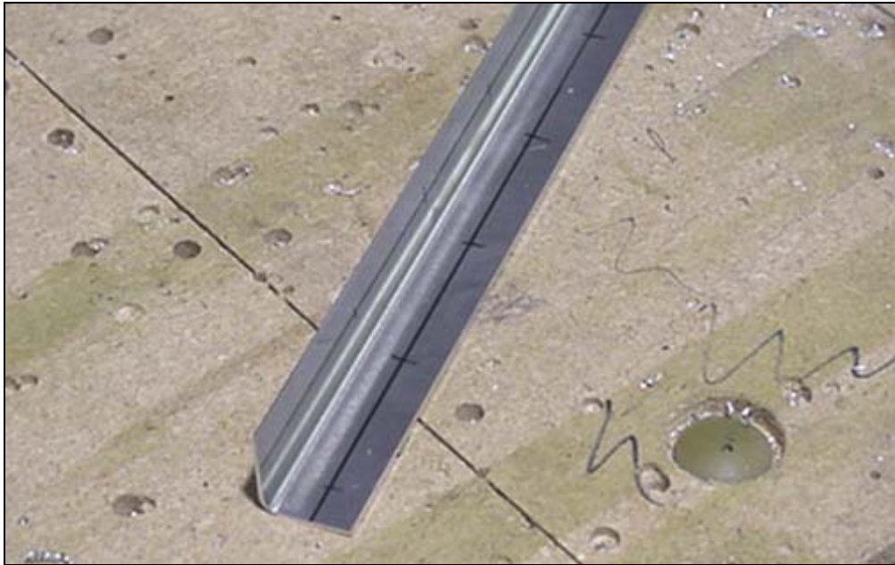
7F7-7SP Top Channel Stiffeners

Layout two rivet-lines on the Top Channel Stiffener.