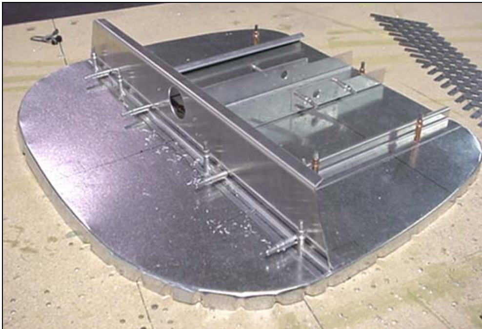
7F7-7SP Top Channel Stiffener

Layout two rivet-lines on the Top Channel Stiffener.