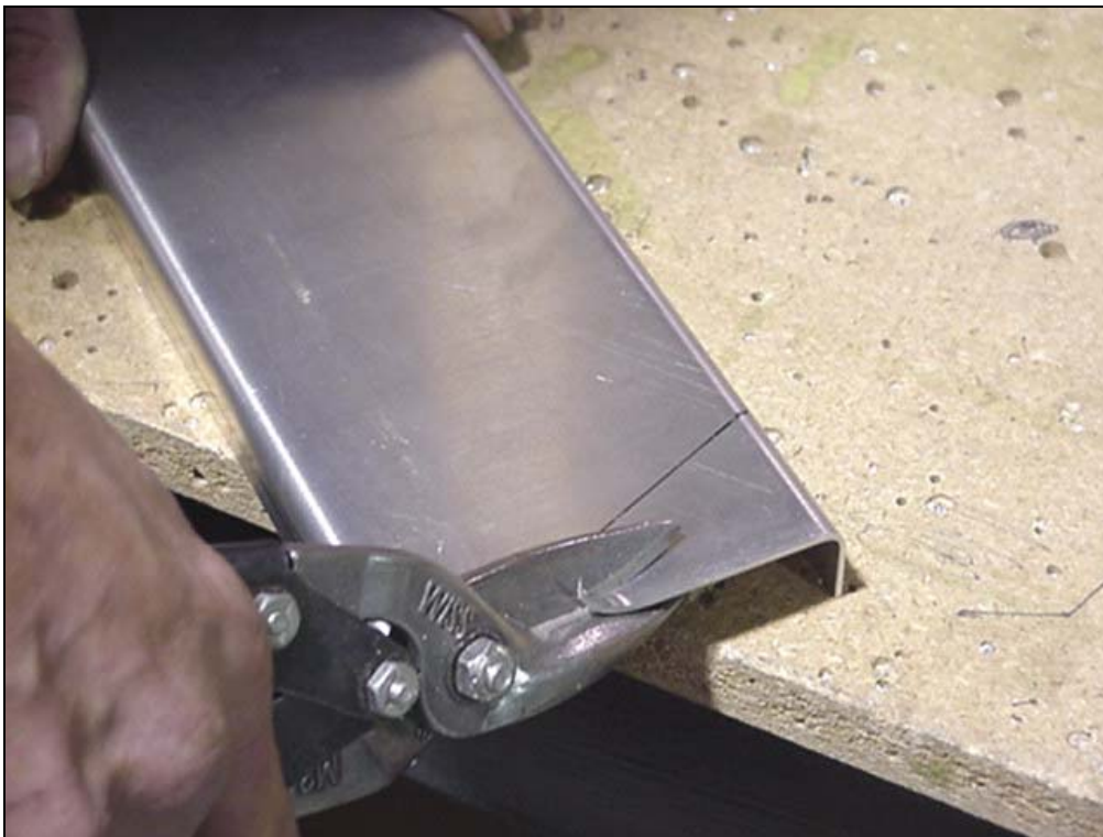
7F7-1SP Upper Channel

The center of the Nose Strut is 60mm from the back of the Upper Channel. Locate and drill a 2" hole in the Channel.