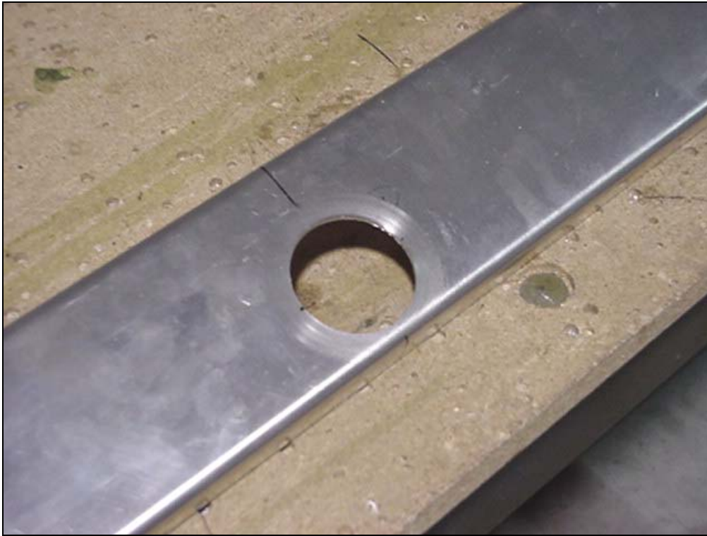
7F7-1SP Upper Channel

The center of the Nose Strut is 60mm from the back of the Upper Channel. Locate and drill a 2" hole in the Channel.