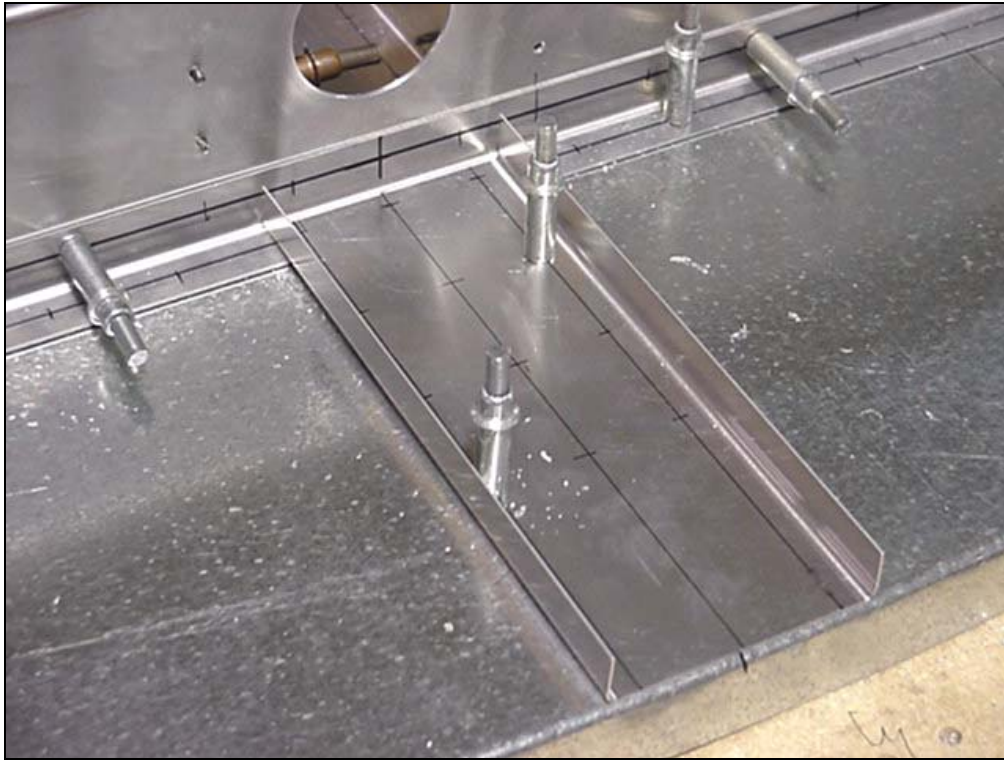
7F7-3 Vertical Top Channel 7F1-1 Firewall

Layout three rivet-lines. Plan for a no rivet zone area for the engine mount. Drill and cleco.