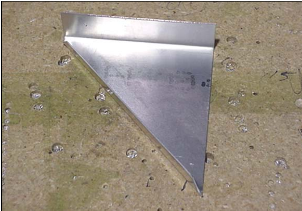
7F7-9C Gear Gusset

Mark a centerline on the inside of 7F7-2C and two rivet lines 60mm apart. Layout the rivet pattern pitch 40 where the bungee pin is located. The rivets need to be 15mm from the center on each side. This will prevent the bungee from rubbing on the rivet heads. Drill and cleco.