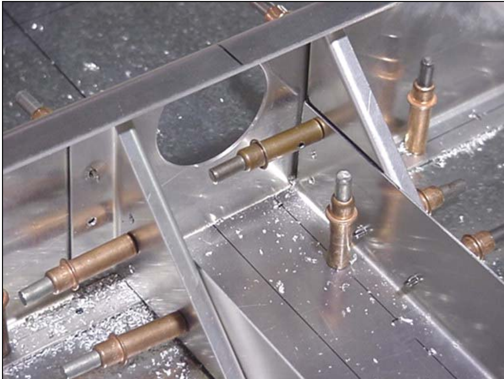
7F7-9C Gear Gusset

The Gear Gusset is positioned on the Vertical Lower Channel and Upper Channel. Using a square will keep the Upper Channel square with the Firewall. Once the Gusset is in position, clamp the Gusset in place.