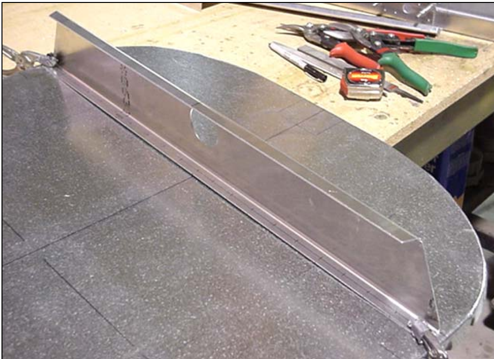
7F7-1SP Upper Channel 7F1-1 Firewall

Layout the other two vertical line for the Firewall Stiffeners. They are located 420mm from each other or 210mm from the centerline. This is the location where the engine mount will be bolted on the firewall bottom.