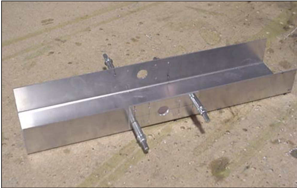
7F7-2C Vertical Lower Channel 7F7-8C Channel Doubler

Open up the center hole to 5/8" hole for the Bungee Pin.