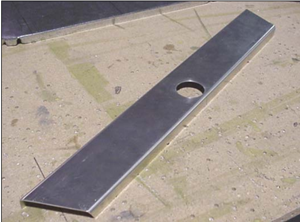
7F7-1SP Upper Channel

Upper Channel ready to install on firewall.