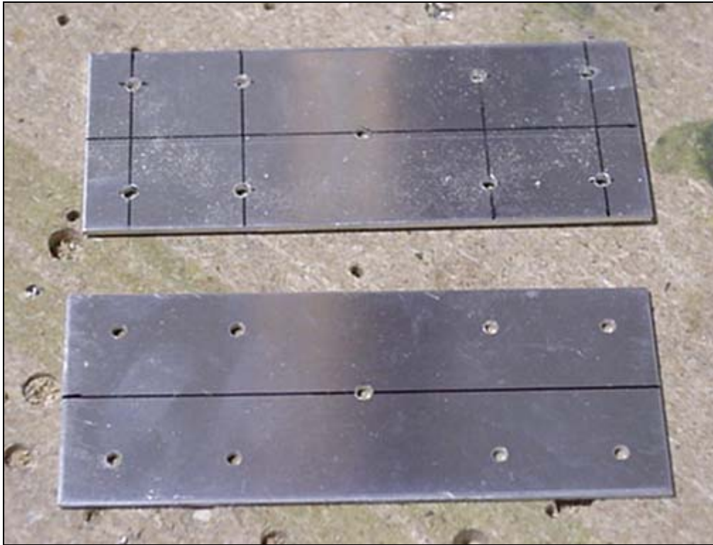
7F7-8C Channel Doubler

Layout the center line and drill a center hole. Then layout four holes on each side of the center hole. The center hole will be opened to 5/8" hole later.