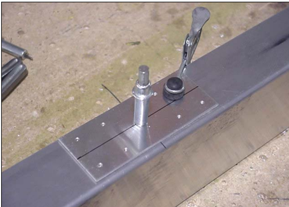
7F7-8C Channel Doubler 7F7-2C Vertical Lower Channel

Layout the center line and drill a center hole. Then layout four holes on each side of the center hole. The center hole will be opened to 5/8" hole later.