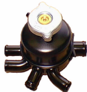
922 398 - Expansion tank