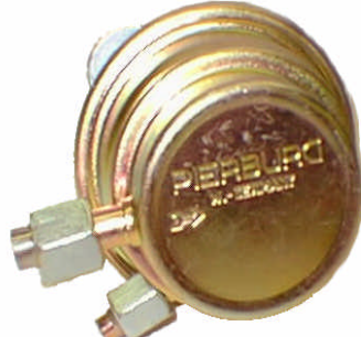
996 594 - 912 fuel pump with threaded fittings