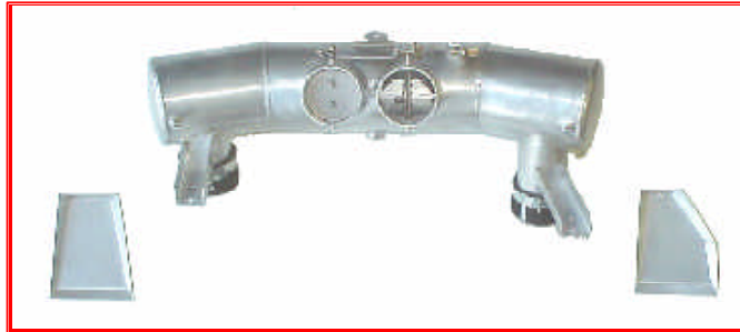
867 756 - Tuned airbox for 912 S UL & 912 S